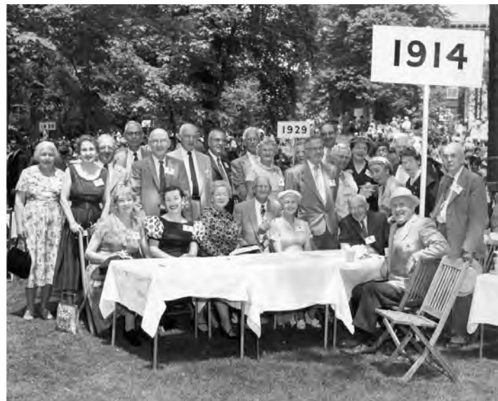
Class of 1914 reunion, 1959

* Distinct total represents the number of unique individuals from each state (domestic) or country (foreign) or lost address (lost) or valid email address only (location unknown). It eliminates any duplicates between multiple degree holders across schools.