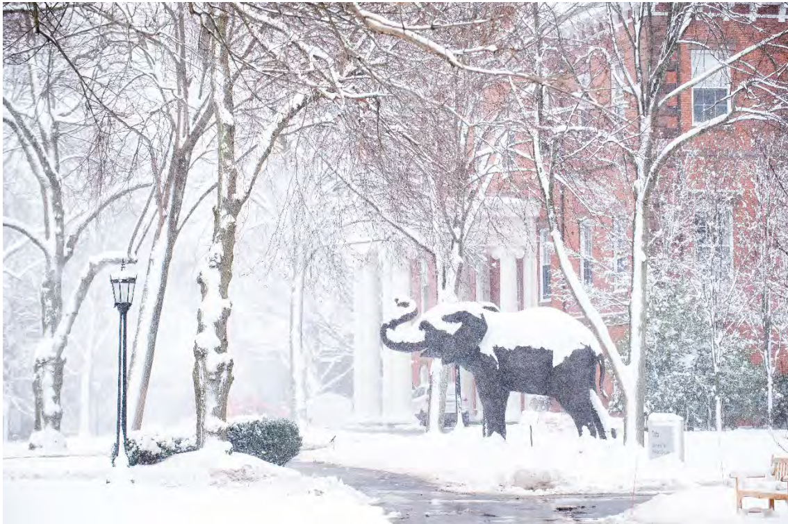
Fresh snow falls on the Jumbo mascot statue on the Academic Quad on January 7, 2022