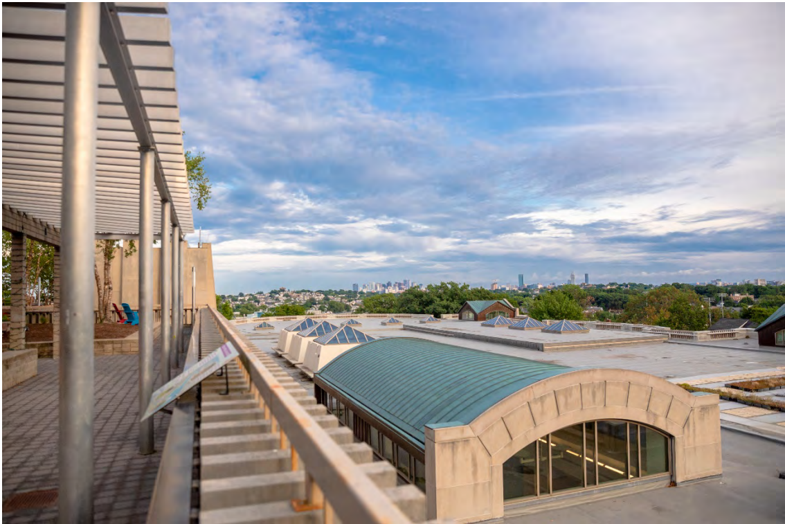
View of Boston from the Tisch Library Roof top during twilight, August 16, 2022