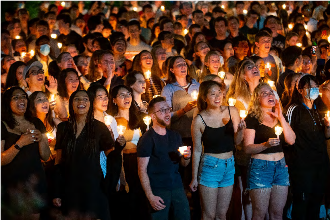
Class of 2022 at the illumination ceremony on May 21, 2022