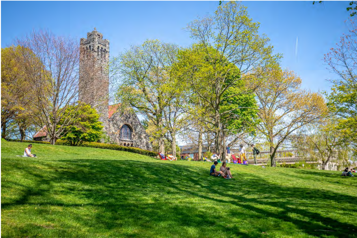
President's lawn and Goddard Chapel, May 12, 2022