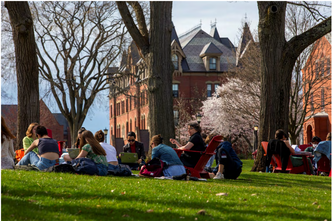
Students and Faculty enjoy a spring day on the academic quad, April 13, 2022

2 This category counts 123 Packard Ave in addition to traditional AS&E graduate spaces