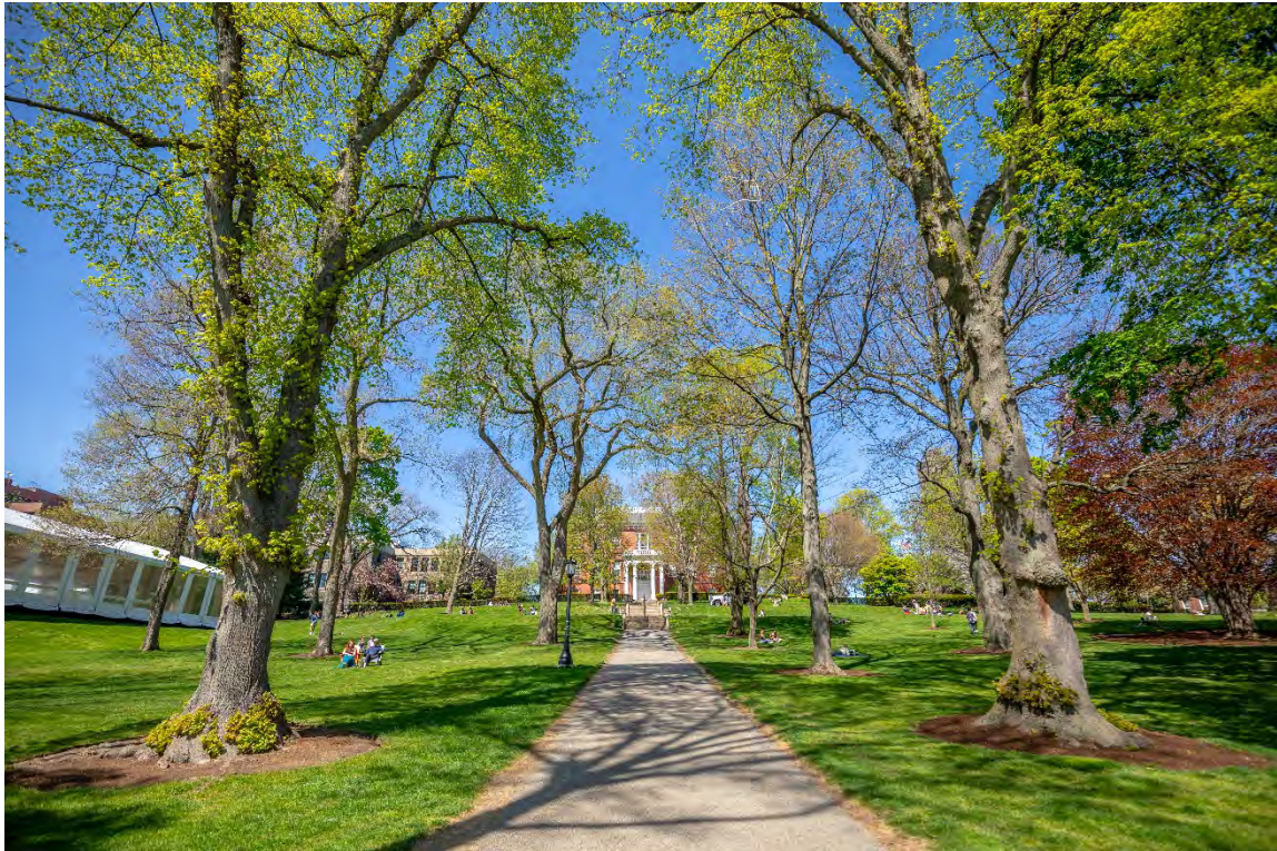
President's lawn and Ballou Hall, May 12, 2022