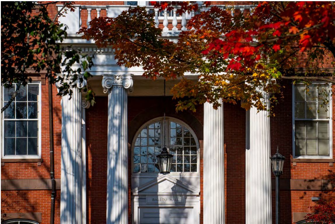
Fall foliage frames the columns of Ballou Hall on October 22, 2020