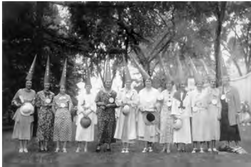
1920 Jackson class reunion, June 15, 1935

* Distinct total represents the number of unique individuals from each state (domestic) or country (foreign) or lost address (lost) or valid email address only (location unknown). It eliminates any duplicates between multiple degree holders across schools.