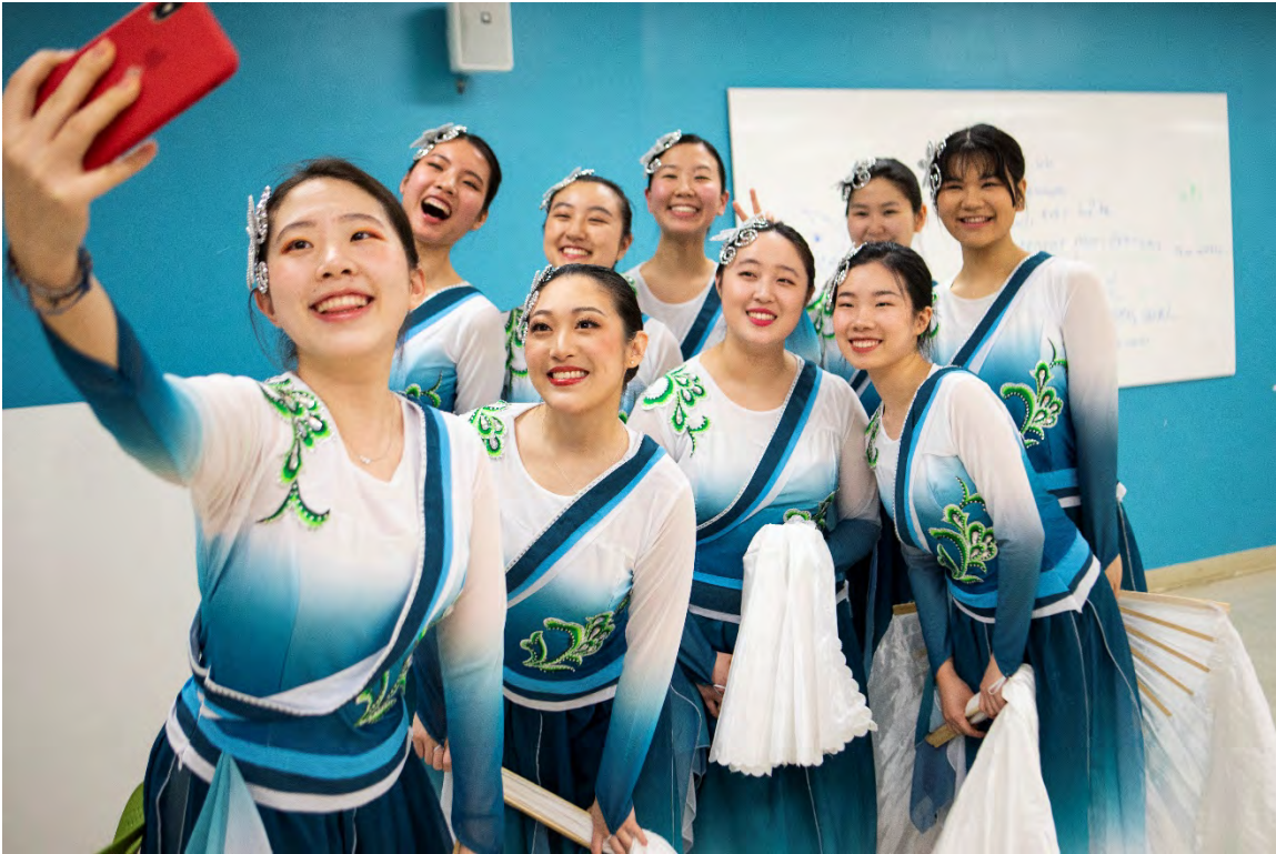
Wuzee, the Tufts Chinese dance troupe, gathers before performing at Parade of Nations, March 6, 2020