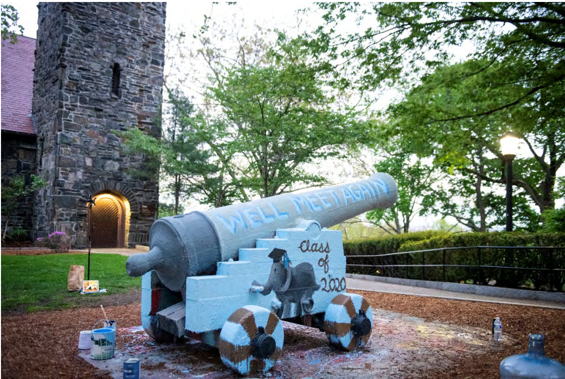
On the eve of what would have been the Commencement ceremony for the Class of 2020, May 16, 2020