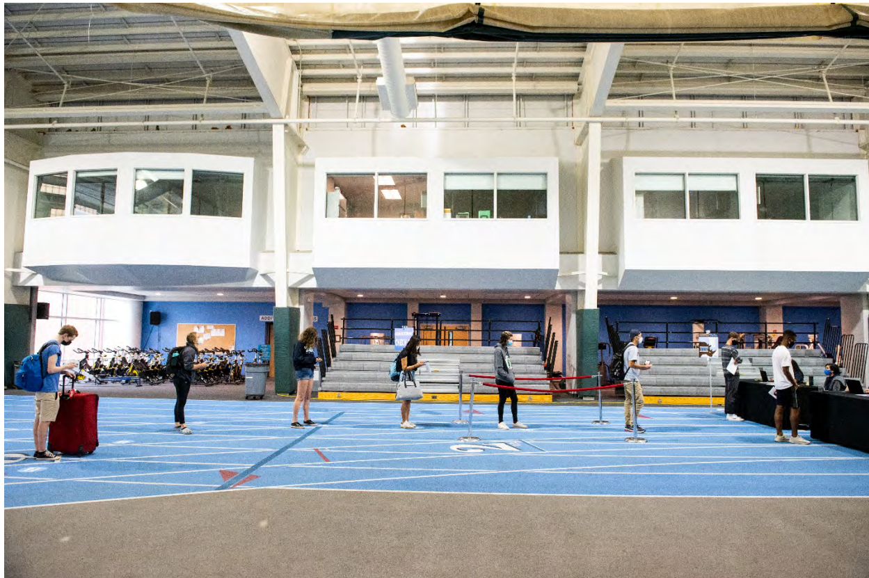
Arriving students line up in Gantcher Center before moving in at Tufts University on August 27, 2020