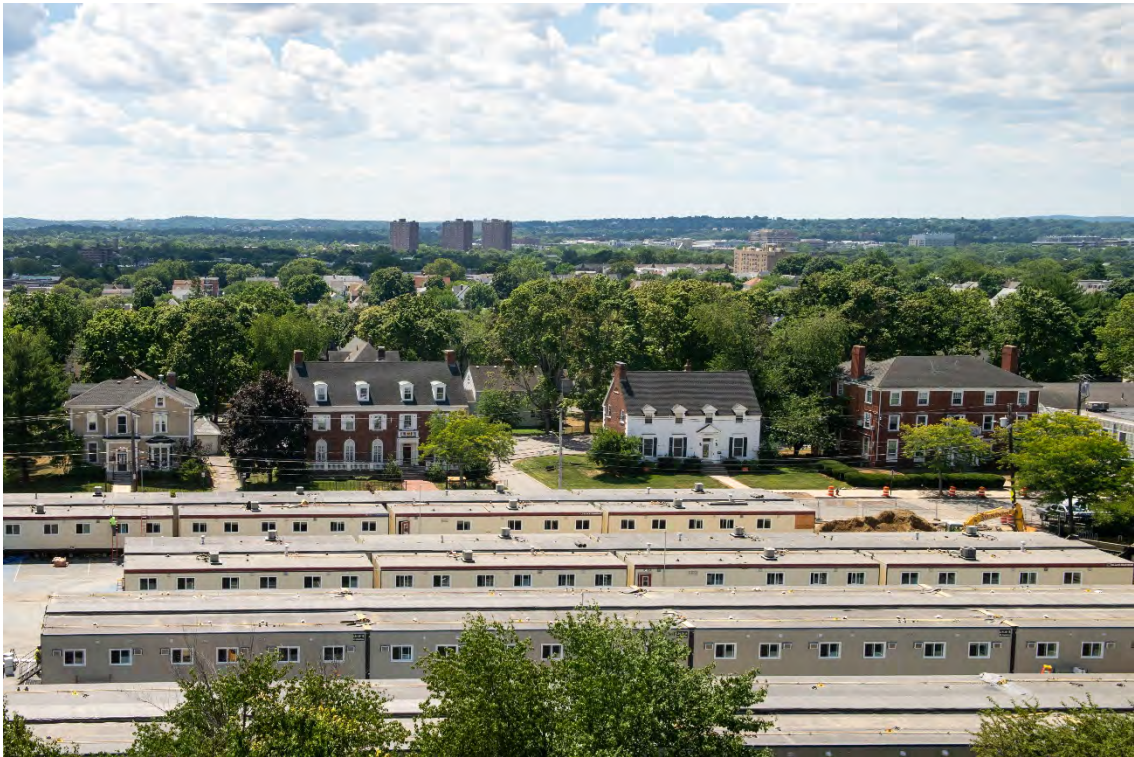
Modular housing units installed on Voute Tennis Courts in response to COVID-19 pandemic, July 30, 2020