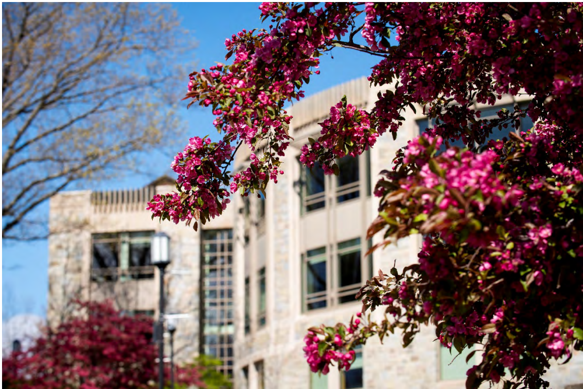
Flowering trees on Professor's Row frame a view of Tisch Library, May 5, 2020