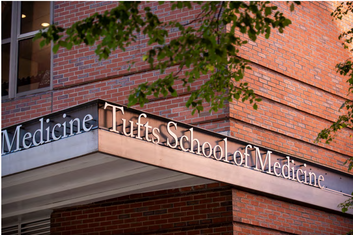
Medical Education Building, at Tufts Medical School, June 8, 2020