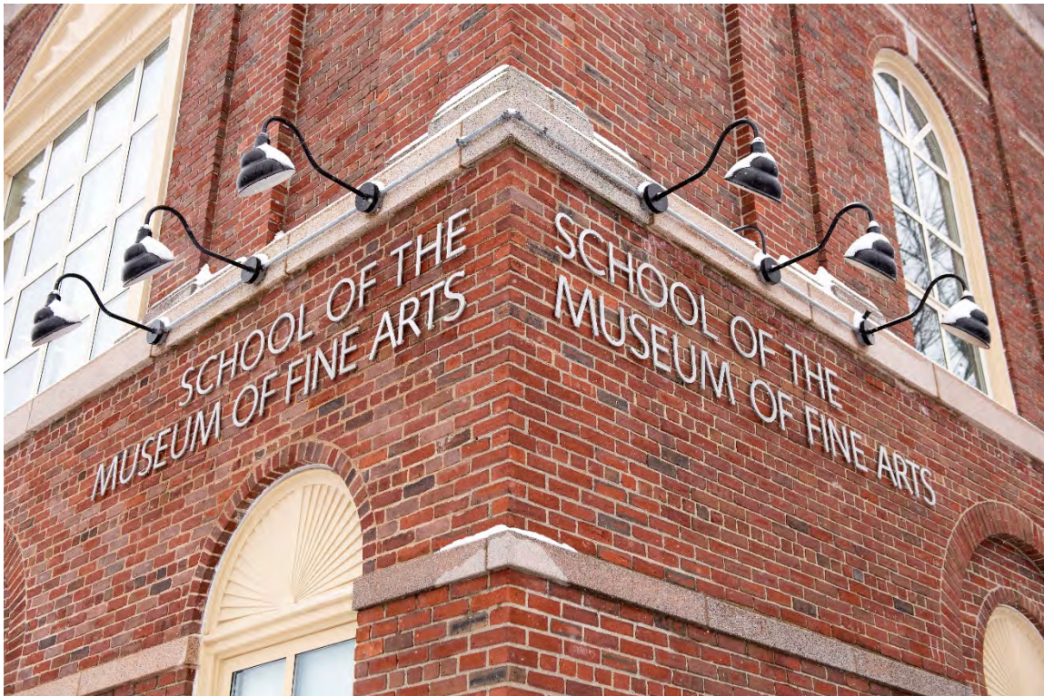
School for the Museum of Fine Arts during a snowfall on December 3, 2019