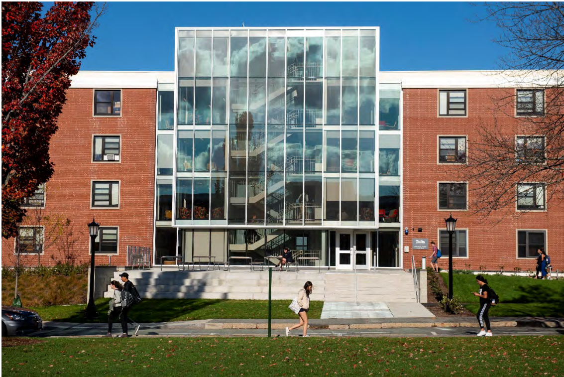
The façade and exterior of Miller Hall on the Res Quad on October 23, 2019