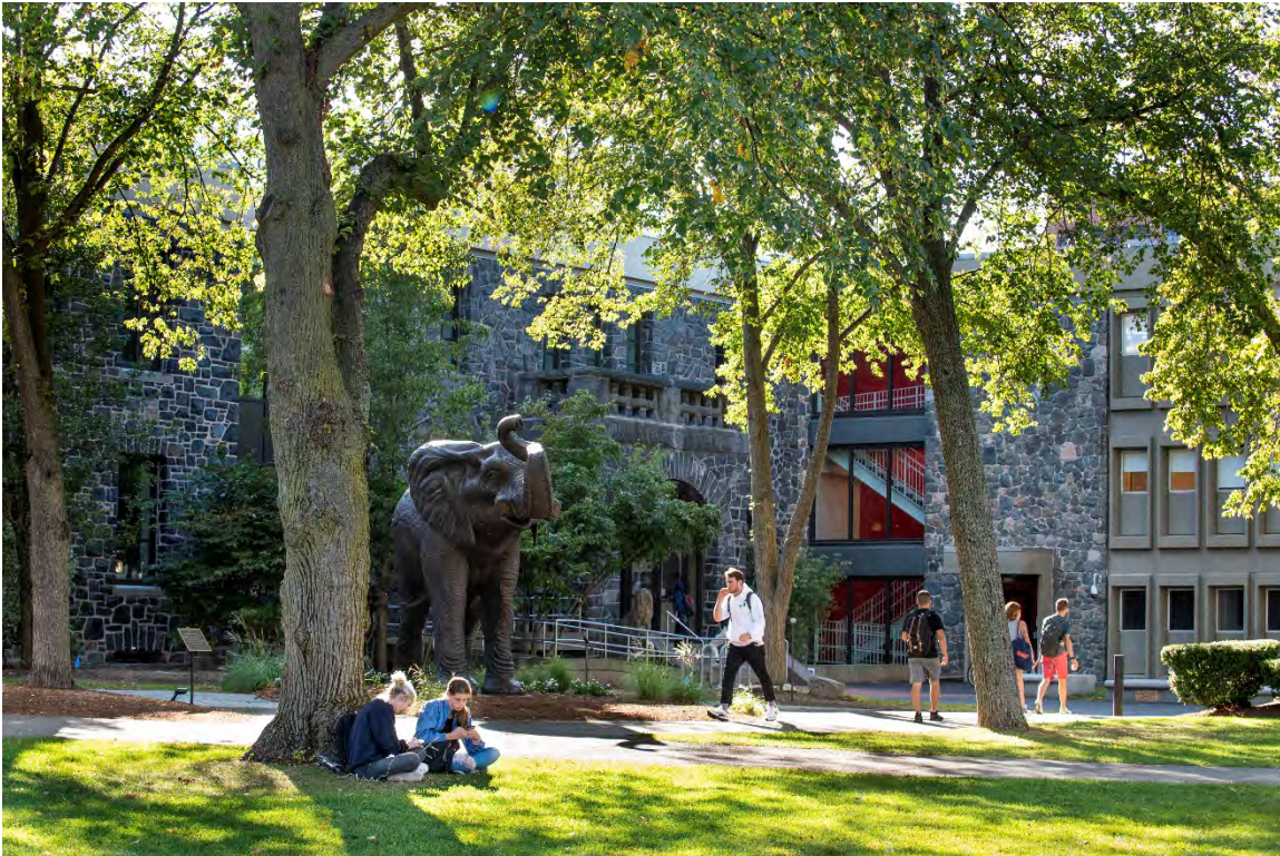
Students walk past the entrance to Barnum Hall on September 16, 2019