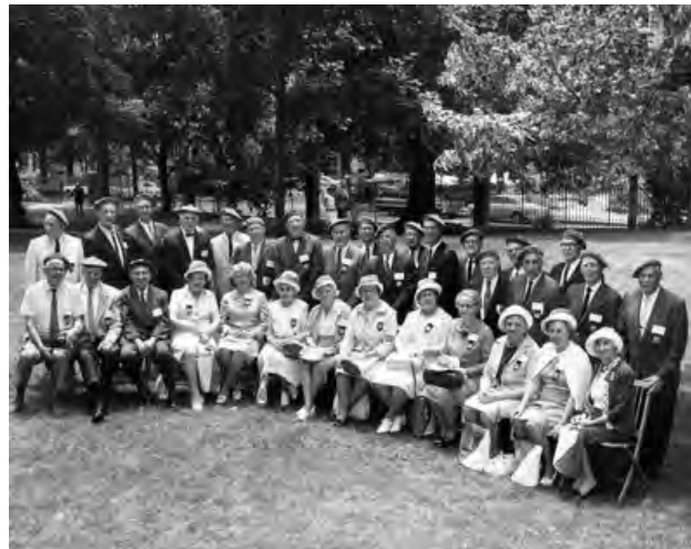
Class of 1918 reunion, ca. 1968

* Distinct total represents the number of unique individuals from each state (domestic) or country (foreign) or lost address (lost) or valid email address only (location unknown). It eliminates any duplicates between multiple degree holders across schools.