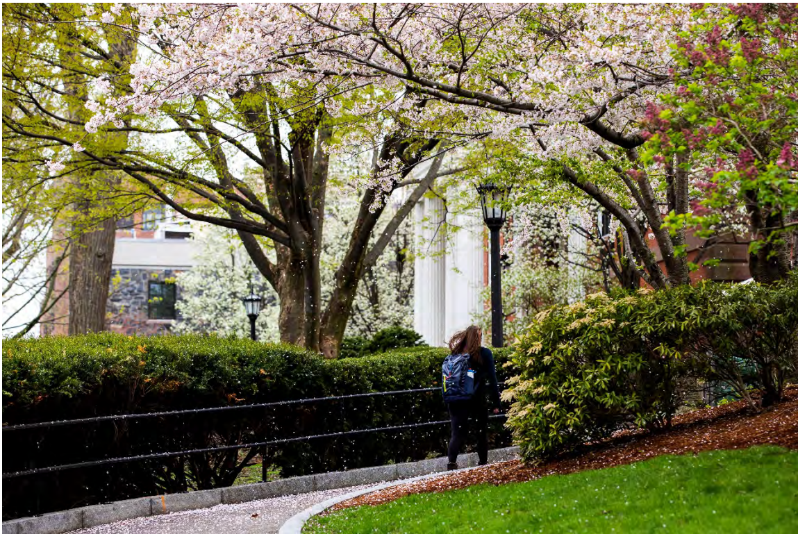
Petals swirl in the wind on a cloudy spring day on April 26, 2019