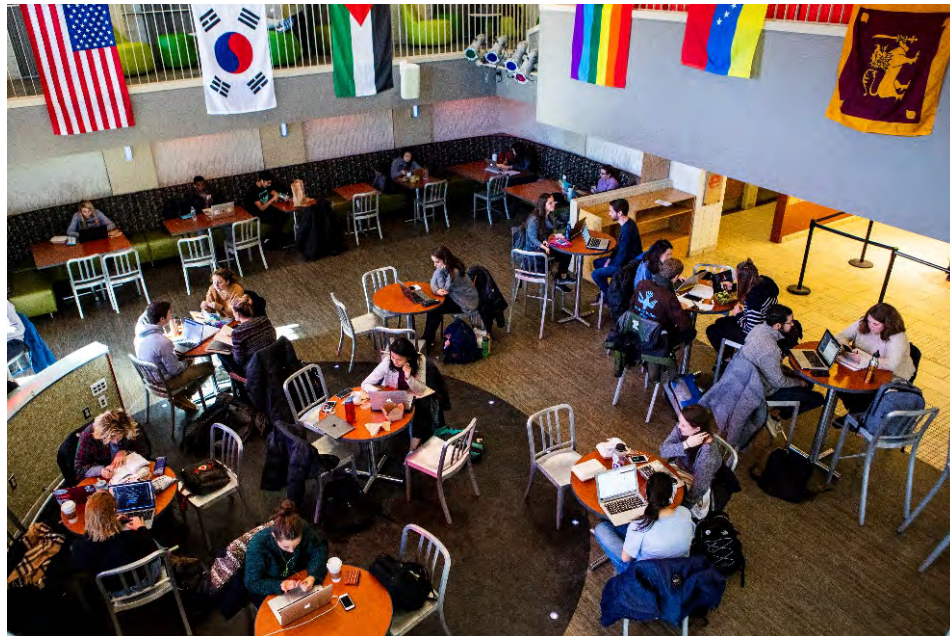
Students at the Campus Center on February 26, 2019

Tufts is a student-centered research university dedicated to the creation and application of knowledge. We are committed to providing transformational experiences for students and faculty in an inclusive and collaborative environment where creative scholars generate bold ideas, innovate in the face of complex challenges, and distinguish themselves as active citizens of the world.