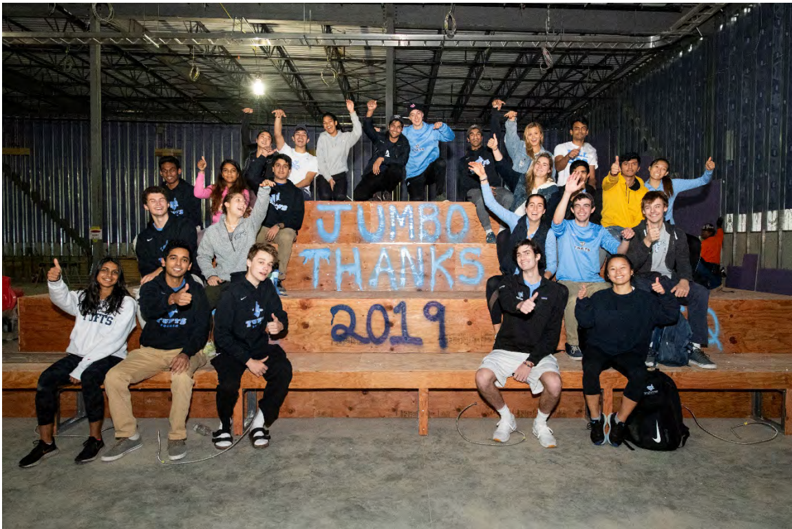
Squash team members thank donors who supported construction of the new squash courts, Oct. 30, 2019