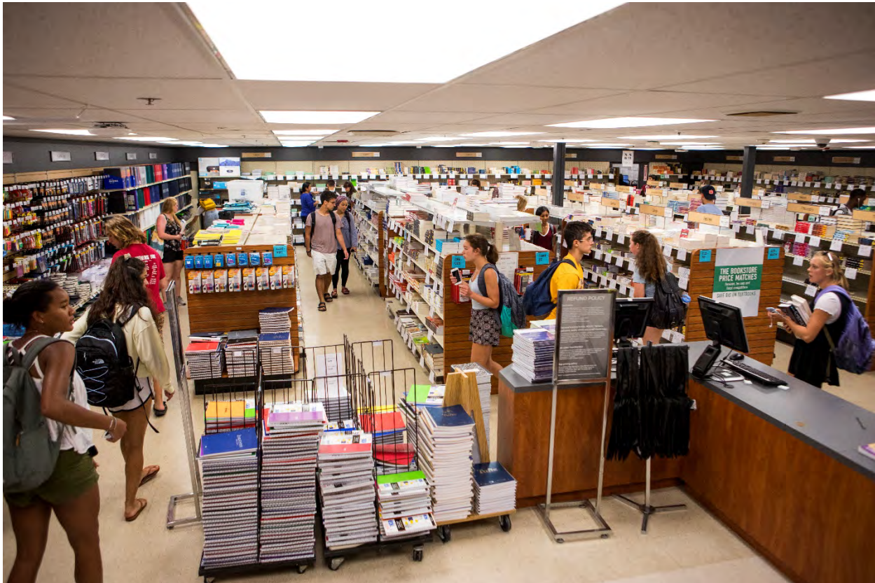
Students stock up on textbooks and supplies at the University Boostore on September 4, 2018