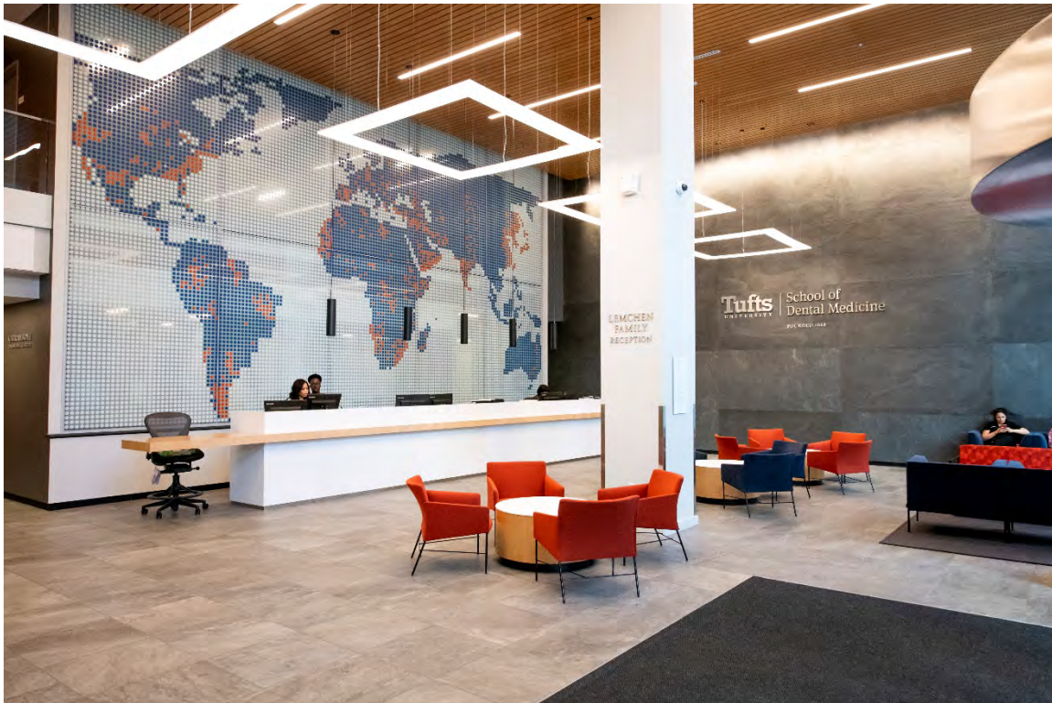
Tufts School of Dental Medicine lobby on September 18, 2019